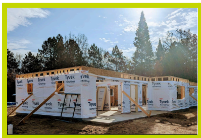
Coolidge Avenue, Rhinelander

Help us build a home in your community! Use the QR code in the lower right corner to enter the volunteer portal. Someone will contact you with volunteer days and details.