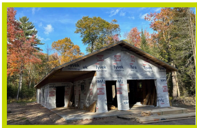
Hemlock Lane, St Germain